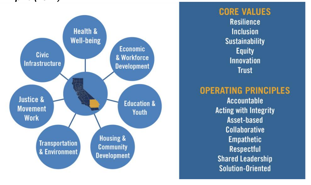
Figure 3 – Priority Issues, Core Values, and Operating Principles for Collective Efforts in the Inland Empire (2021)

Based on the survey responses and deliberative discussions, the Center for Social Innovation organized the top responses into the 6 core values and 8 operating principles, as presented in Figure 3 below.