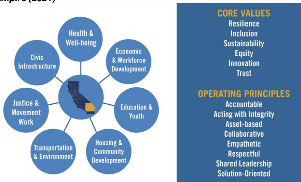
Figure 3 – Priority Issues, Core Values, and Operating Principles for Collective Efforts in the Inland Empire (2021)

Based on the survey responses and deliberative discussions, the Center for Social Innovation organized the top responses into the 6 core values and 8 operating principles, as presented in Figure 3 below.